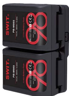
Fit 2x PB-M98S batteries 98Wh+98Wh=196Wh