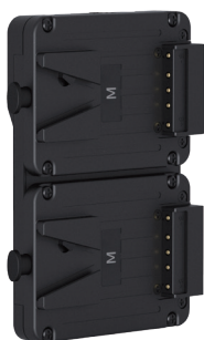
KA-M20S Hot swap plate