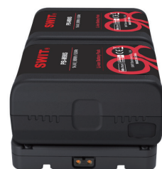
Compact and balanced