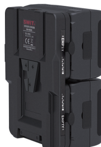
Power/hot swap indicators for each battery